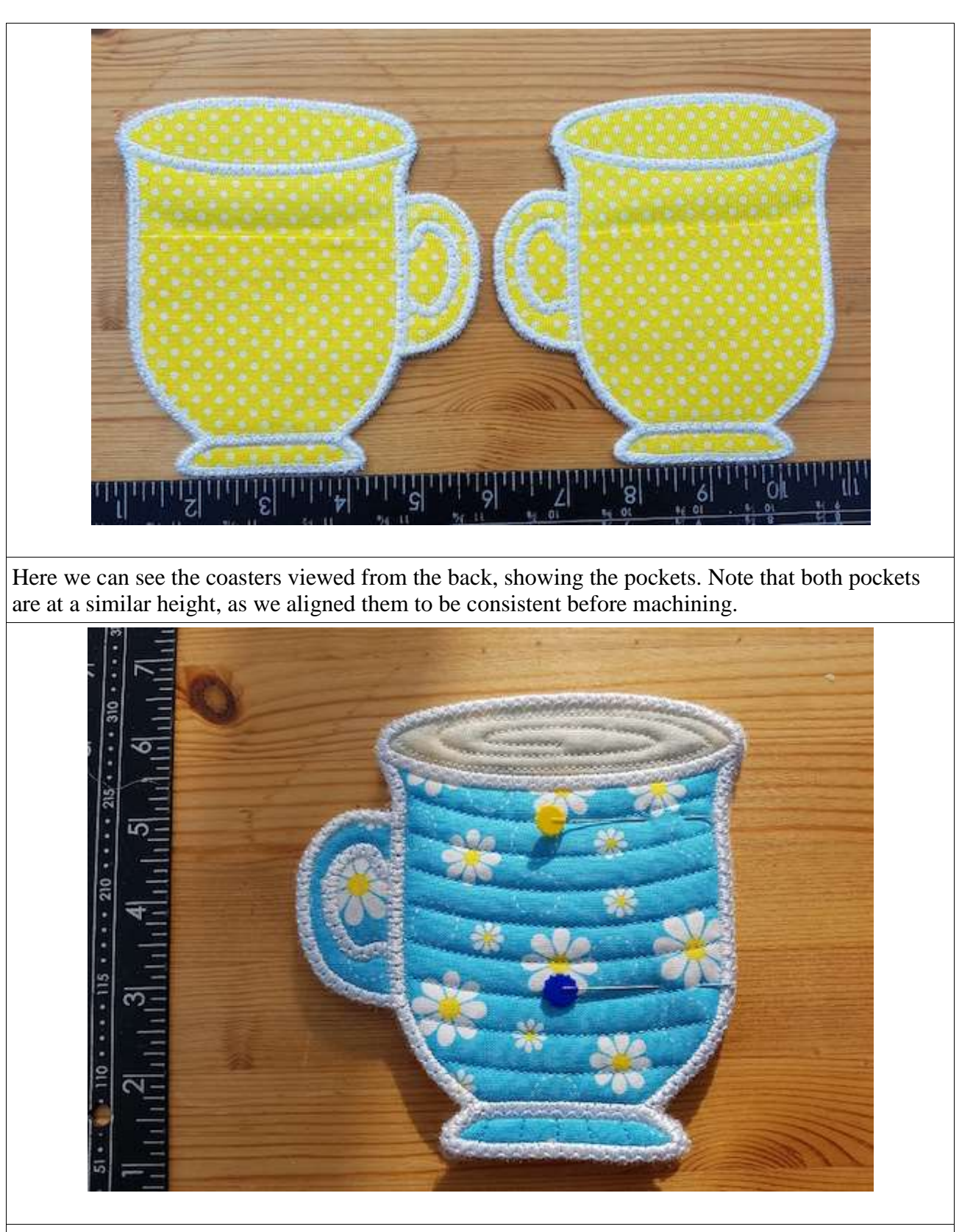
Pin the two coasters together pocket side to pocket side and pin as shown above,