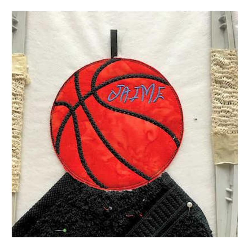
Now its just a matter of stitching your last Color which zig zags, then stitches the Satin Stitch edge