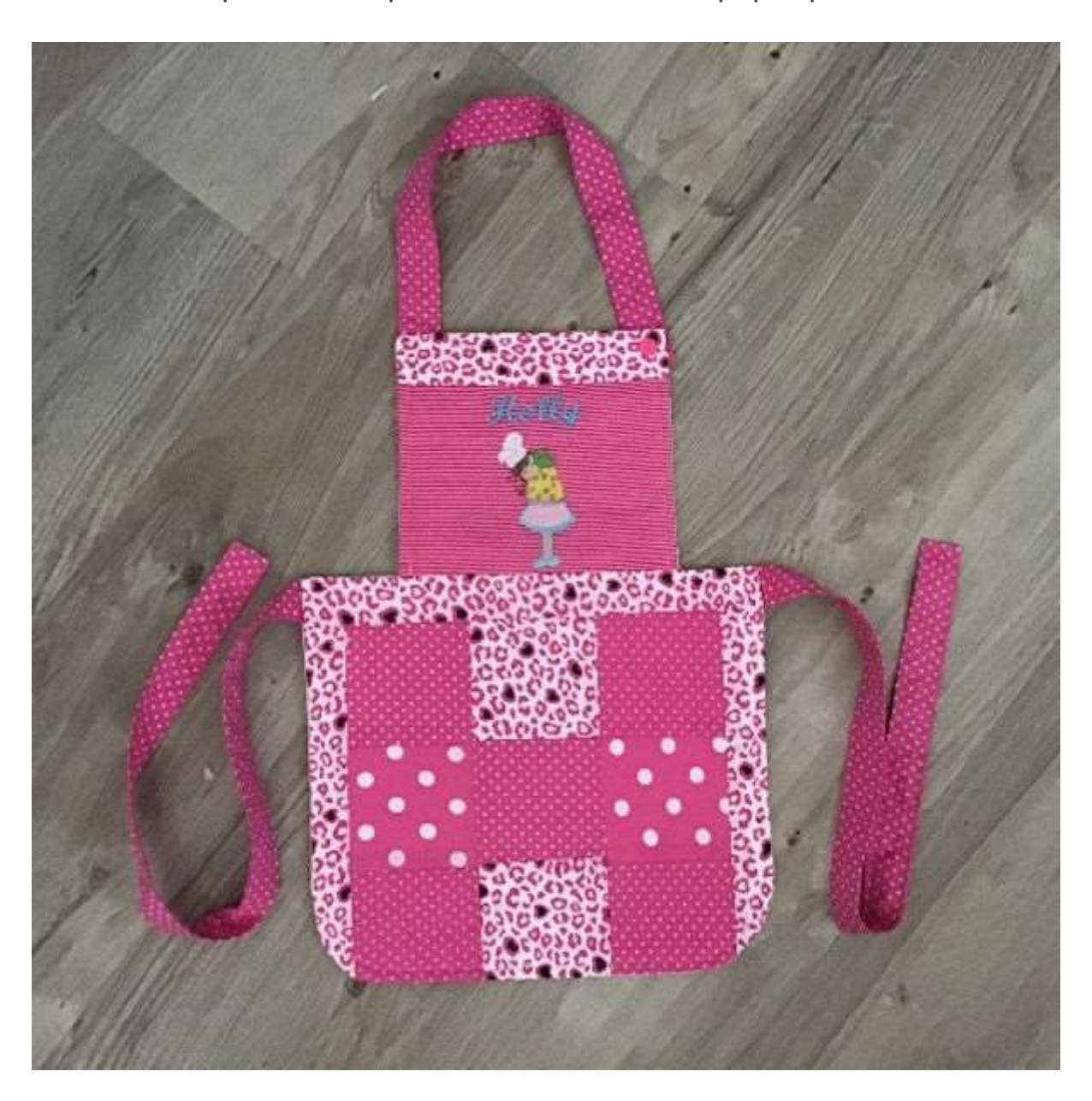
Cut the pattern at the base of the armhole, leaving you a skirt piece and bib piece (both squares)

If you are not so keen on creating the curves, the alternate version with a square bib top starts with the same paper pattern.