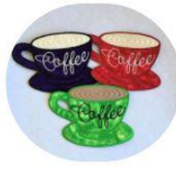
Designs made with Freebies