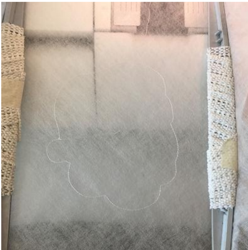
Stitch Color 1 – the outline of the Coaster