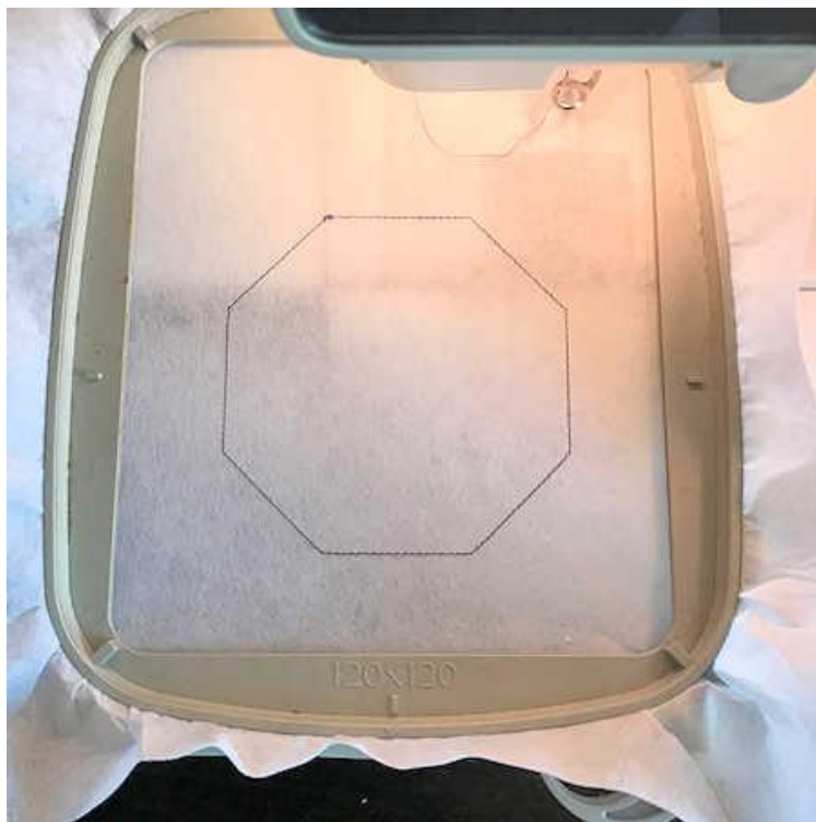
Load Hexagon Coaster Design