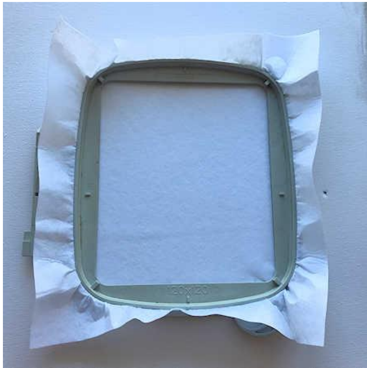
Hoop Cut away Stabiliser